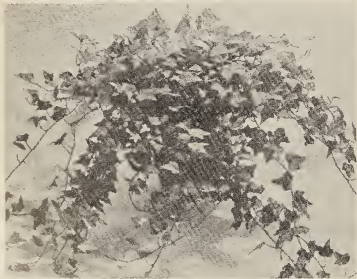
New Self-Branching Ivy

Doz. 100 2 1/4 inch pots..... $1.10 $7.00